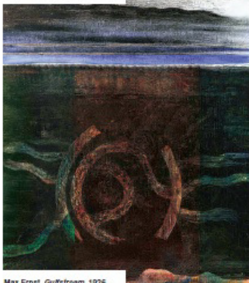
Max Ernst, Gulfstream , 1926